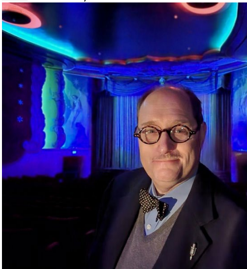
Matias Bombal Photo provided