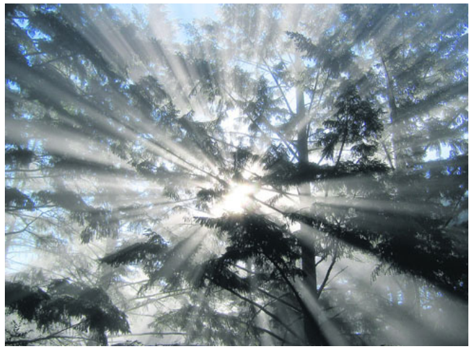
"The Light Comes Through" Caitlin Burnite