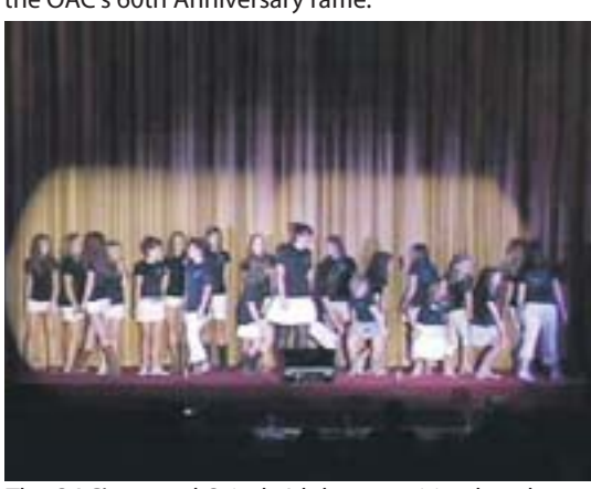
The OAC's annual Orinda Idol competition has drawn enthusiastic participants throughout Lamorinda, including this middle school group of finalists from last year's competition.