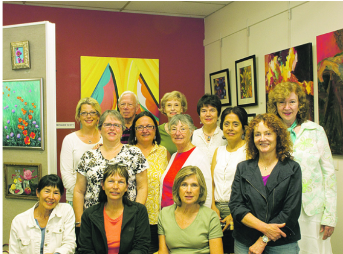
Moraga Art Gallery members

wall artists," she said. "All 18 artists are participating in the anniversary exhibit. Since we've never done the Orinda Gallery space-and it's a large space-we have a lot of participation."