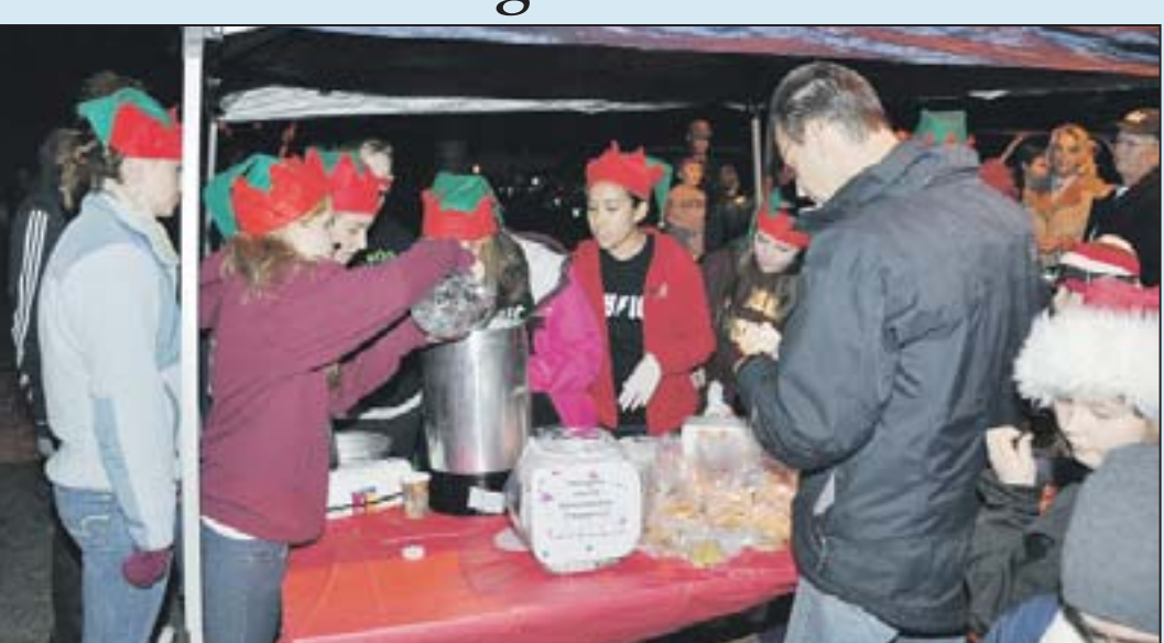
The Moraga Youth Involvement Committee serves the community at the Tree Lighting event at