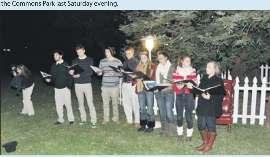
A Capella carolers entertain the crowd