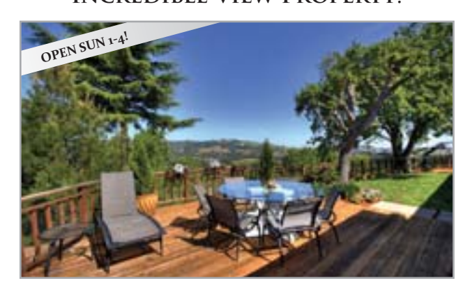
3396 East Terrace, Lafayette