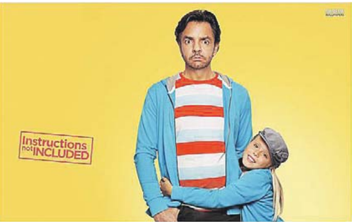
'Instructions Not Included" Loreto Peralta and Eugenio Derbez