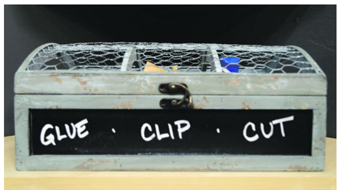
This clearly labeled box keeps supplies tidy.

Reach the reporter at: info@lamorindaweekly.com