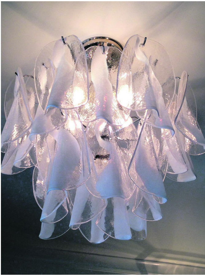
Whimsical overhead lighting is used to create the proper ambiance in this Lafayette home.

LAMORINDA WEEKLY | Studious Feng Shui for Fall