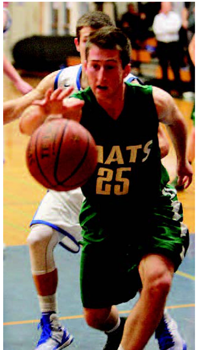
Jackson Wegener

Reach the reporter at: <a href="mailto:info@lamorindaweekly.com">info@lamorindaweekly.com</a>