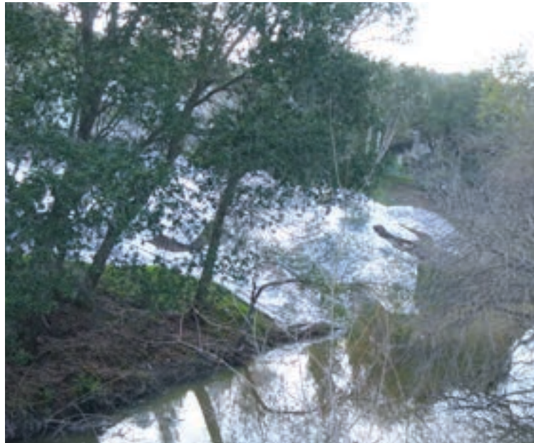
The hillside that failed along Moraga Creek a year ago is still tarped.

Moraga pedestrians used to be treated to a nice walk along Moraga Creek up to the crossing of the Lafayette-Moraga trail and Canyon Road. Nowadays when one ventures on the Canyon Bridge, the access to the trail is closed, and has been since January of 2016.