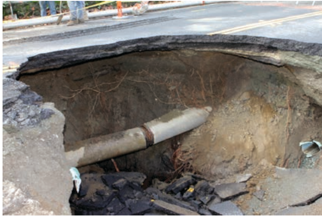
Sinkhole reveals broken culvert that requires a new large diameter pipe to contain major EBMUD water main, PG&E gas pipes, and Contra Costa County Sanitary District sewer pipes.

Orinda raced to get sinkhole repairs underway as the unusual closure of Miner Road is adding 20 minutes to the response time for emergency vehicles, including to Sleepy Hollow Elementary School.