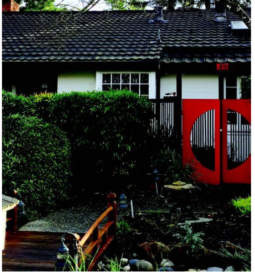
This Moraga residence has strong front entrance Feng Shui with lush greenery and chi-attracting and protective red front doors.

Why is the home's front entrance so, well, front and center in Feng Shui?