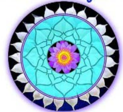
SPACE AS MEDICINE