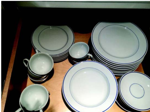
De clutter like the kitchen drawer in this Moraga home, as even drawers and closets matter in Feng Shui.

With so much not under our control it's nice to know that if we change our space we can begin to change our life in meaningful ways. Taking the first step IS a new beginning so allow these Feng Shui tips to honor the spring season in your own home, and just experiment with what resonates most for you.