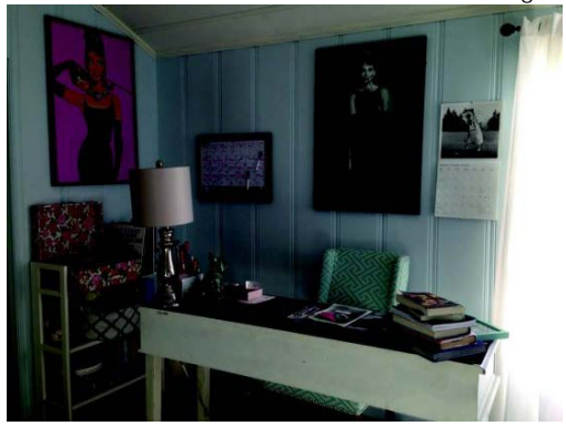
Beds, desks and if possible the kitchen stove should be in the power or "Commanding Position" like this correctly placed student's desk in Orinda.