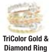
TriColor Gold & Diamond Ring