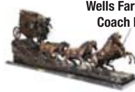
Wells Fargo Stage Coach Bronze