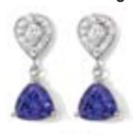
20CT Tanzanite & Diamond Earrings