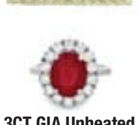
3CT GIA Unheated Ruby Ring