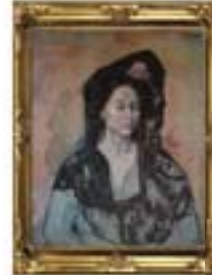
Picasso Signed and Numbered Lithograph