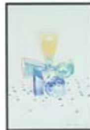
Andy Warhol Committee 2000 Signed Lithograph