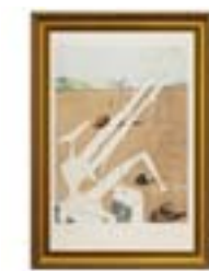
Salvador Dali Lithograph