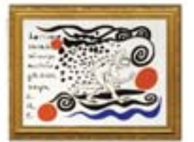
Alexander Calder Signed Lithograph