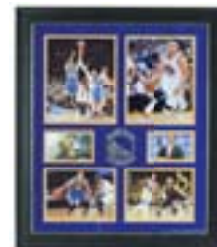
Sports Memorabilia Collection