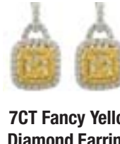
7CT Fancy Yellow Diamond Earrings