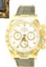
Rolex Daytona with paper