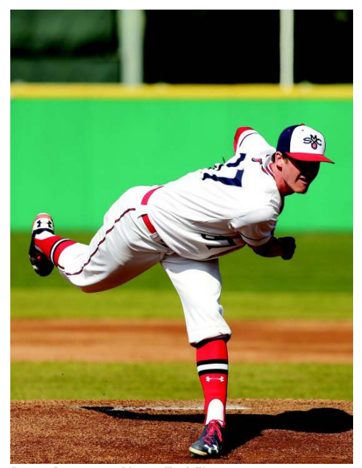
Drew Strotman