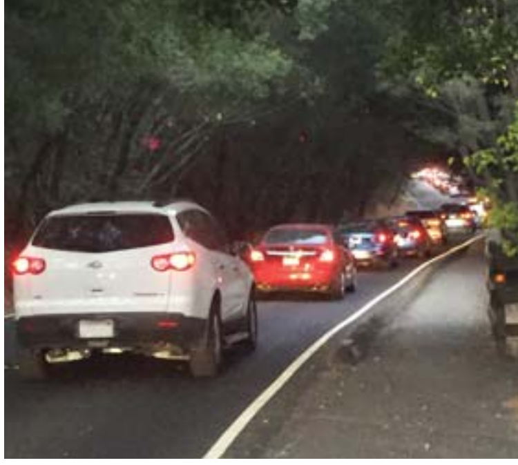
The morning commute on Reliez Valley Road.

A barrage of speakers from the Reliez Valley Road area addressed the Lafayette City Council at its Oct. 23 meeting, complaining about delays and unsafe driving conditions and pleading for solutions to the problems.