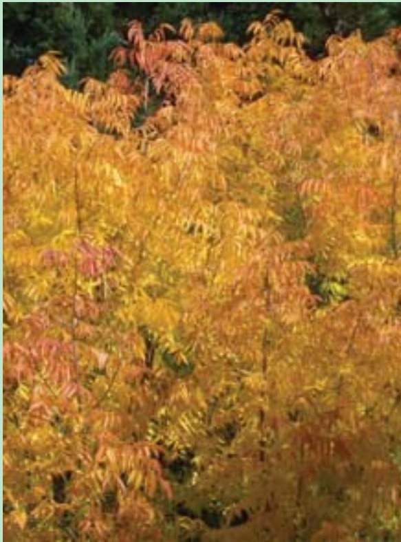
Vibrant colors of the pistache change with the autumn coolness.