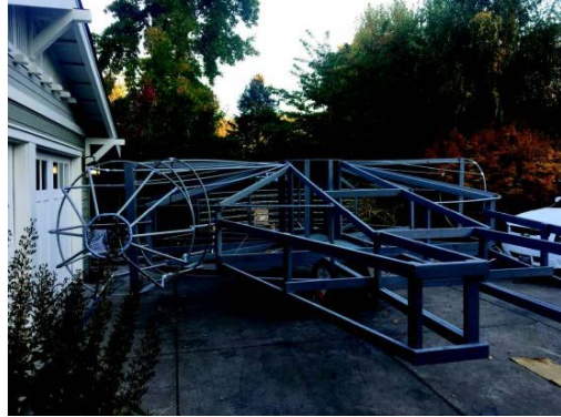
Framework assembled, and filling up the driveway.