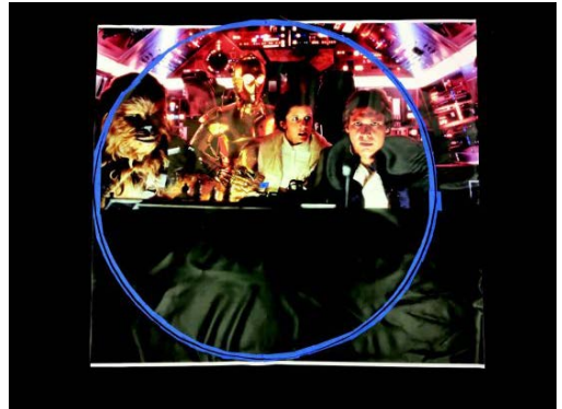
Familiar faces, both human and humanoid, look toward the stars.