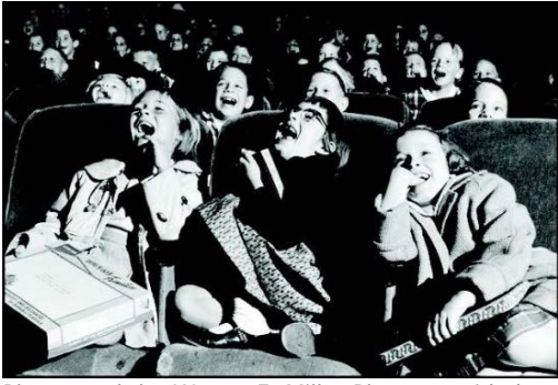
Photograph by Wayne F. Miller Photo provided

Reach the reporter at: info@lamorindaweekly.com