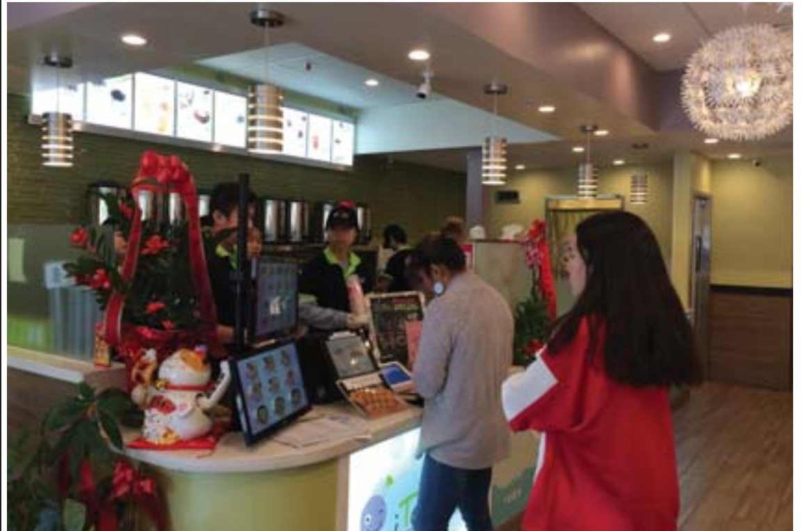
Customers get their boba tea at i-Tea in Moraga