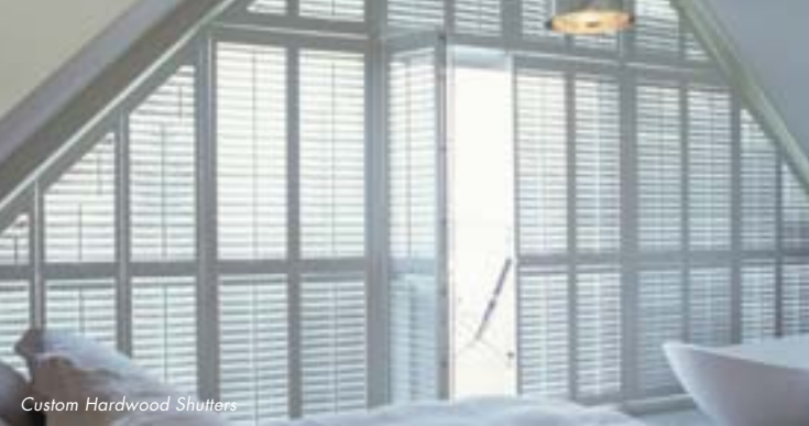
Custom Hardwood Shutters

IT'S OUR BIGGEST SALE OF THE YEAR BIG SAVINGS ON THE STYLES YOU'LL LOVE.