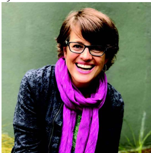
Kelly Corrigan

In an era when difficult conversations are the norm, there's good reason to be grateful for Kelly Corrigan. Following her New York Times bestselling memoirs, "Glitter and Glue" and "The Middle Place," the Oakland author delivers 12 essays based on hard to say phrases in a new book, "Tell Me More" (Random House).