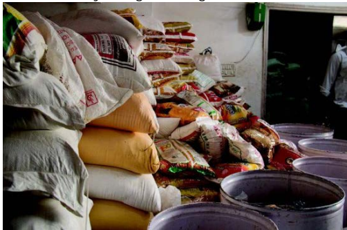
Donated food stores at this Sikh temple in India.

Reach the reporter at: sora@lamorindaweekly.com