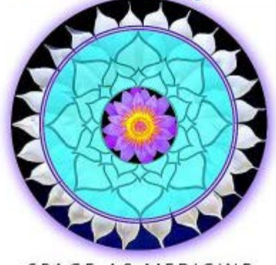
SPACE AS MEDICINE