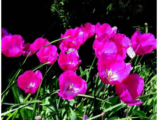
Traveling often involves stopping and smelling the flowers. Placing a photo like these colorful poppies enjoyed on a trip to Big Sur recently can help activate the Travel, Helpful People and Heaven Bagua area.