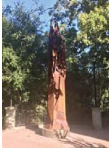
Sculptures by artist Ben Trautman in downtown Lafayette.

them during the day, since they blend so well into the stonework. However at night, illuminated with blue light, the panels are striking.