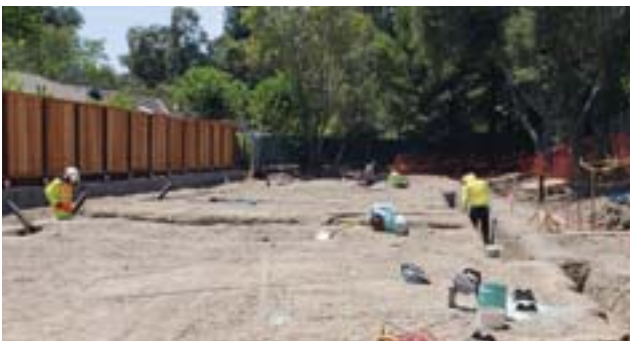
Workers prepare fire station pad for underground utilities in this late July photo. Retaining wall is at left.