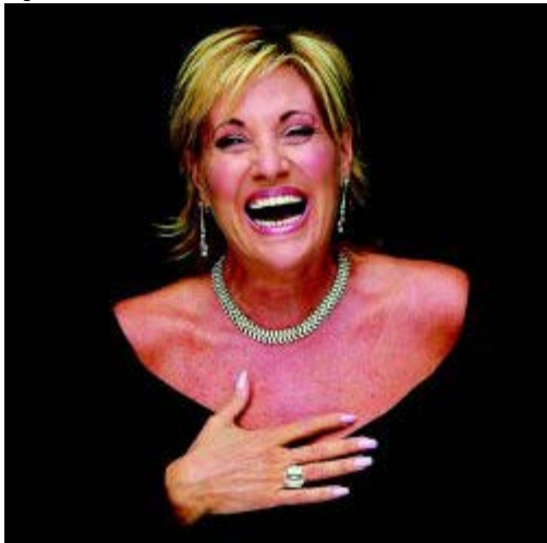
Lorna Luft

Lorna Luft was born into Hollywood royalty, the daughter of Judy Garland and film producer Sidney Luft ("A Star is Born"). She will be bringing her musical talent to the Orinda Theatre at 7:30 p.m. Oct. 4 as part of the fall concert series, Live at the Orinda, where she will be singing the songs her mother taught her.