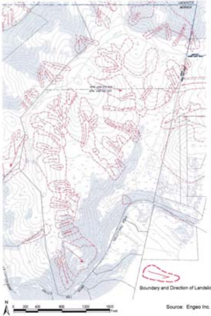
Map of existing landslides – a concern identified in the Bollinger Valley Project Environmental Impact Report.