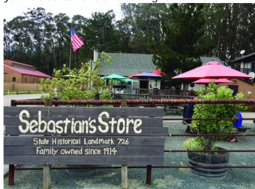
Sebastian's in San Simeon

Day 3: Continue south on Hwy 1 through Morro Bay and San Luis Obispo to Avila Beach. This idyllic seaside enclave features not only surf and sand, but also verdant greenery, a golf course, and an epic bike path, best meandered via electric bike rented at Pedego on First Street. The power boost allows for exhilarating exploration; charge any hill with ease for ultimate vantage points. Later, treat yourself to a soak at Sycamore Mineral Springs Resort where 23 private hot tubs dot the oak tree-canopied hillside, each bubbling with naturally heated mineral spring water. Check in at oceanfront Avila Lighthouse Suites where every beach-themed, spacious suite features a patio or balcony with ocean views, and where fresh cookies await at check-in. From here, you're within walking distance of the quaint surf shops and restaurants along Front Street. For dinner, try Blue Moon Over Avila and behold the spectacular sunset that is served with your citrus ceviche and sauvignon blanc.