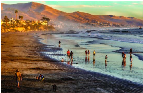
Sunset at Cayucos beach

For the past five years I've driven back and forth to Santa Barbara countless times. I might stop in Paso Robles for lunch on the square, or perhaps in San Luis Obispo for a High Street Deli sub. But never have I passed over the mountains that divide Highway 101 with Highway 1. Big, big mistake. The stretch of coast between Big Sur and Santa Barbara, known as Highway 1 Discovery Route SLO CAL, is remarkable for its beauty and the variety of its charming towns. Jump on at any point within its 101 miles and find expansive beaches, quaint hotels and restaurants, bike paths, room to breathe - and little traffic. This is a side of California long thought lost and gone forever. But it's real, and it's spectacular. Explore with your partner, with your family, or go solo (as did I) for a personal retreat that will leave you feeling revitalized and refreshed. Here's a suggested itinerary: