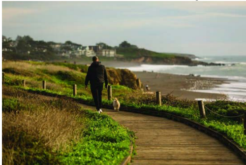
Boardwalk in Cambria