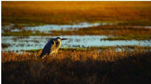
Sea bird in Los Osos

Reach the reporter at: info@lamorindaweekly.com