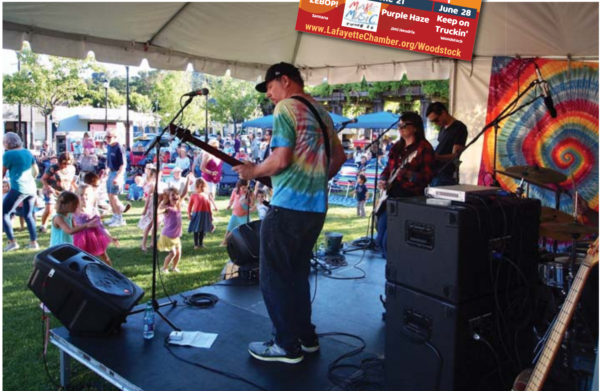
The Fog City Swampers opened the Concert at the Park series at Lafayette Plaza Park on June 7.