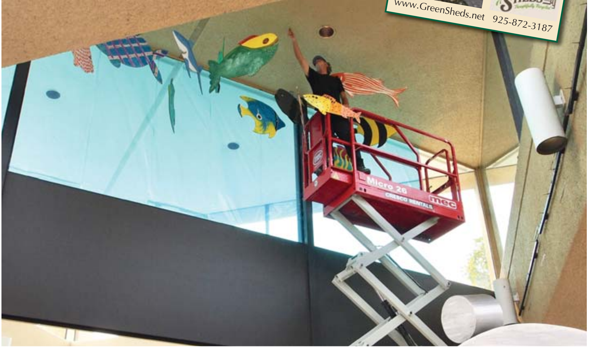
The process of hanging and lighting the fish Oct. 1 at JPG@TheBank in Lafayette took 12 hours.