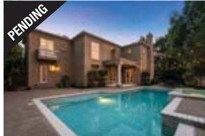
LAUREN DEAL/HURLBUT TEAM