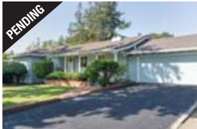
SMITH HOMES TEAM