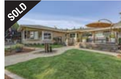
2040 MONTCLAIR CIRCLE, W.C. CALL FOR DETAILS