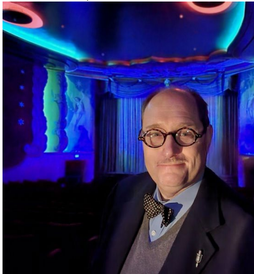
Matias Bombal Photo provided