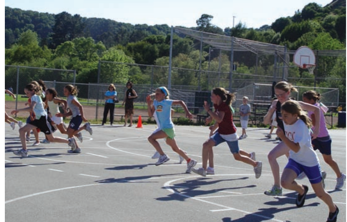
5th grade girls 50 yard dash