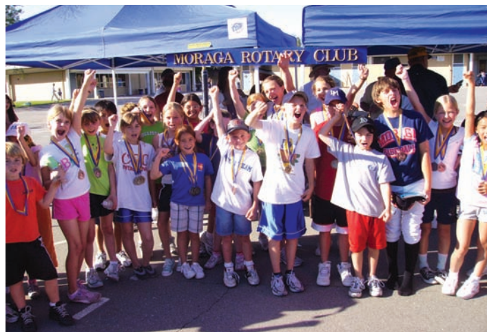
Winners Celebrate at Moraga Rotary Field Day Photo provided

Joaquin Moraga • Lafayette Elementary • Los Perales • Miramonte • Orinda Intermediate • Sleepy Hollow • Springhill • Stanley Middle • Wagner Ranch