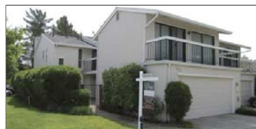
653 Augusta Drive, Moraga $885,000 Spacious 4Br/2.5Ba First Open Sun. 1-4