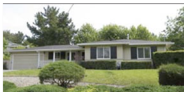
30 Ramona Drive, Orinda $875,000 Darling 3Br/2Ba First Open Sun. 1-4