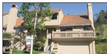
275 Paseo Bernal, Moraga $785,000 End-unit Light + Bright Open Sun. 1-4