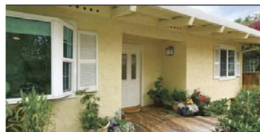
121 Cypress Pt. Way, Moraga $779,000 MCC Single Lvl 2Br+Den Open Sun. 1-4