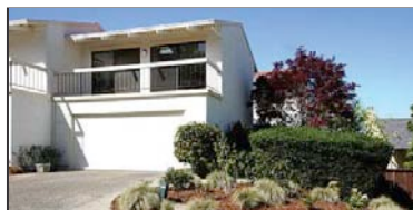
10 Berkshire Drive, Moraga $849,000 Updated 3Br/3.5Ba First Open Sun. 1-4