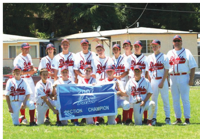
2007 Diablo Valley Team