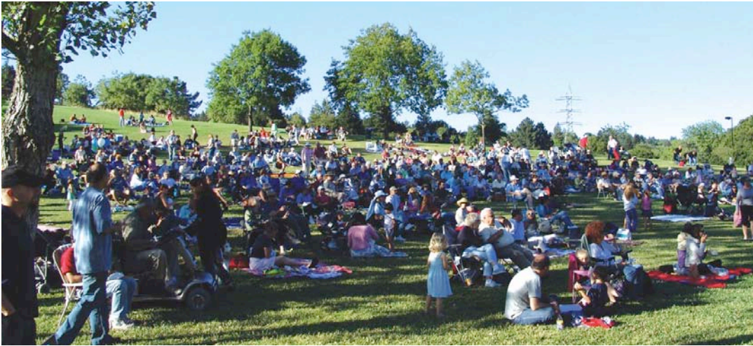
Concert at the Moraga Commons