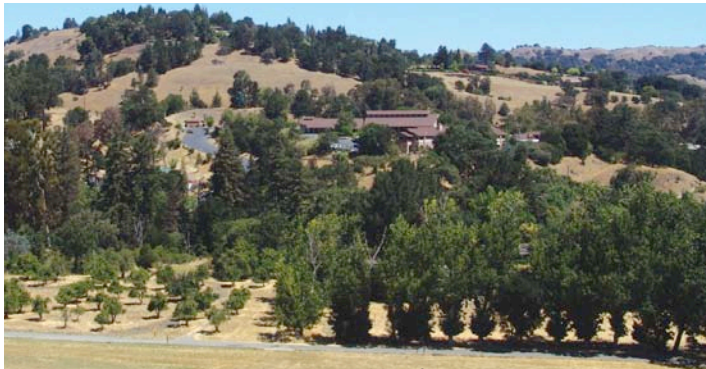
Sanctuary and Temple Isaiah Classroom Building from Reservoir Parking Lot

The Planning Commission heard an initial proposal last week from the Contra Costa Jewish Day School, a K-8 parochial school, which is requesting a land use permit and development permit to expand its existing facility at 3800 Mt. Diablo Blvd.