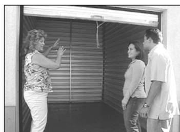
5A CAN SHOW YOU HOW TO GET MORE SPACE AT HOME OR WORK