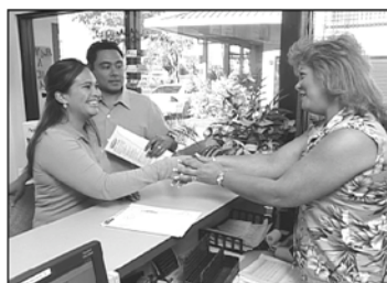
OVER 30 DIFFERENT SIZES, WITH A PRICE FOR EVERY BUDGET!