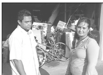
GOT A GARAGE OR SPARE ROOM THAT LOOKS LIKE THIS? YOU NEED STORAGE!