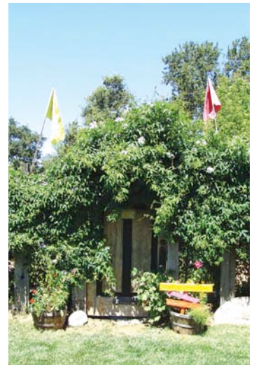
The gate to the "Garden of Learning"

Admission to all six gardens is $15 in advance, and goes up to $20 after August 31. The themed gardens are all different, there's one on a hillside, one salvia-focused, one with alternatives to lawn, and more. All are close enough to drive to in the allotted time. For more information contact