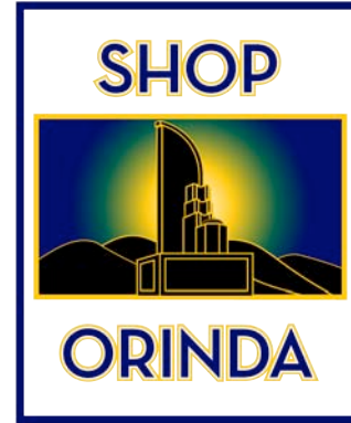
The new Shop Orinda Logo

The “Shop Orinda” logo was created by Cedric Cheng Design. Cheng discussed the logo with the Chamber, and proposed different options. “The graphic the Chamber chose uses the visual of the Orinda Theater,” says Cheng “one of the last standing buildings of Art Deco design in the area, a landmark that gives the town its special identity.”