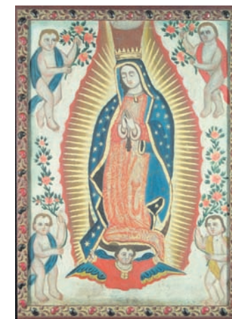
Our Lady of Guadalupe(Nuestra Señora de Guadalupe) Maker unknown; h. 13 3/4 x w. 9 5/8 inches; oil on tin

Soda Activity Center Tickets are $25 general; $20 Seniors (over 65); $12 Non-Saint Mary's students, SMC faculty and staff and; $2 Saint Mary's students For info, call (925) 631-4381