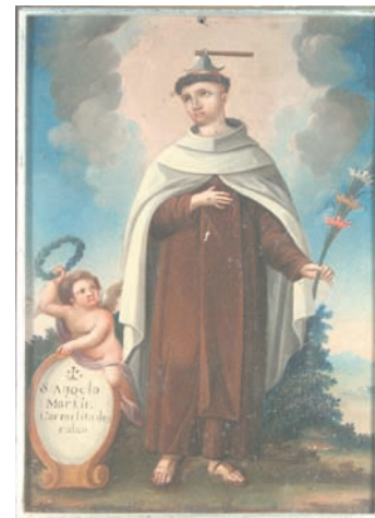
St. Angelo the Martyr - Maker unknown; h. 14 x w. 10 inches

The event, which includes a daylong Eco-Fair and evening symposium, is part of a national teach-in on climate change called Focus the Nation that will involve more than 1,000 colleges, schools, civic groups and faith organizations during the last week of January. The symposium culminates the Saint Mary's College Focus the Nation event with experts discussing the challenges and opportunities presented by climate change and what it will take to cut greenhouse gas emissions by 2 percent over the next decade. Wednesday, Jan. 23 from 11 a.m. to 5 p.m. (Eco-Fair); 7 p.m. (Symposium), Soda Center; Free For info, visit: http://www.stmarys-ca.edu/news-and-events/focus-the-nation/index.html