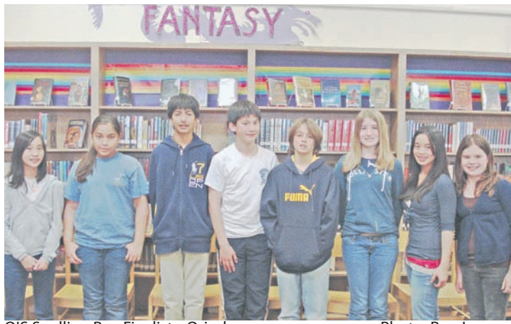
OIS Spelling Bee Finalists, Orinda

Over the past two weeks, area schools have hosted competitions to identify their best spellers. With words such as mononucleosis, penitentiary, epiglottis, deterge, and cauliflower, Lamorinda students in 3rd through 8th grades have demonstrated their mastery of the English language or at least the sequence of its letters. The winners of the local Spelling Bees will head next to a county-wide contest held in March. The county winner