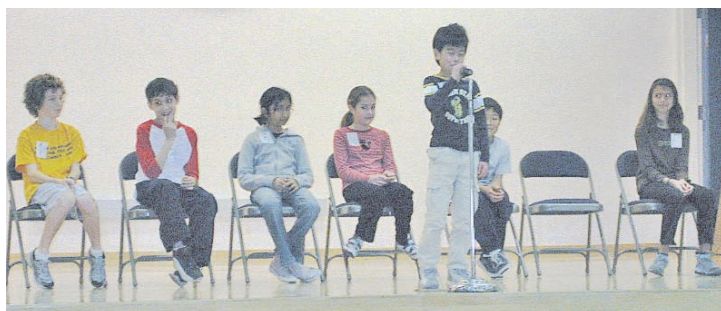
Rheem School Spelling Bee, Moraga

then has the opportunity to participate in the Scripps National Spelling Bee that is held in Washington, D.C. in May.