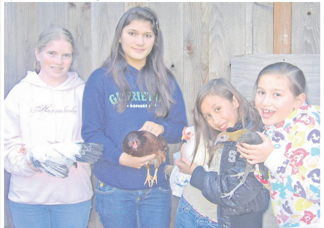
Members of the Lamorinda Poultry 4-H Group after a trip to the Stockton poultry show