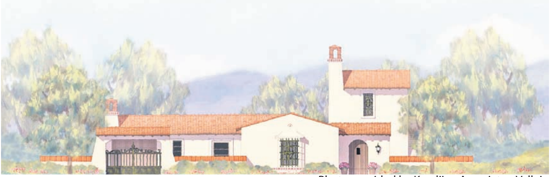
Elevation and site plan of one of the four single family homes that were approved by the City of Orinda in December. This particular home is two stories and features an inner courtyard. Architect Robert Hidey Architects, Landscape architect Hart Howerton and Master developer Brooks Street

t the Orinda City Council Meeting on February 5, staff recommended that a hearing to consider the formation of the Wilder Geologic Hazard Abatement District (GHAD) be set for March 4 at the Library Auditorium. Interested residents are welcome to attend.