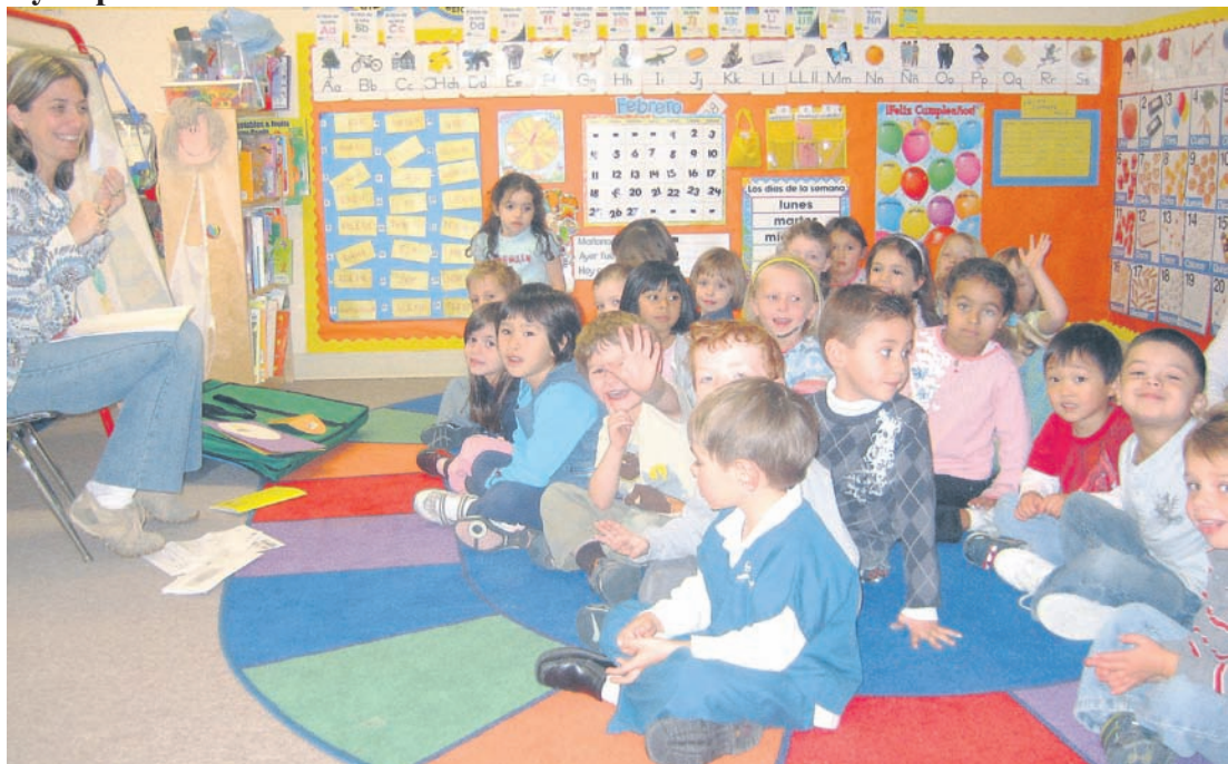
Pre-F class at KISS