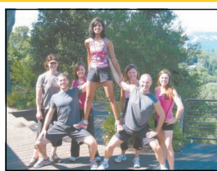
Living Lean Team