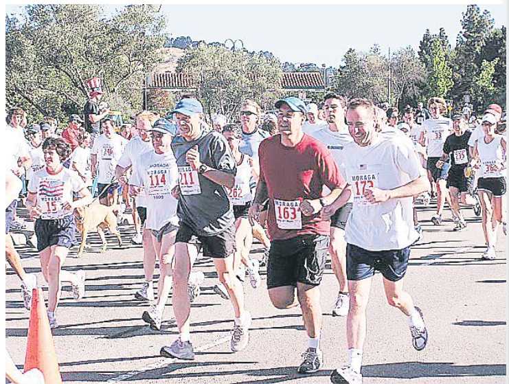
2007 4th of July race

The MOFD has also issued its traditional annual warning: Fireworks may be canceled up to 15 minutes before the show, if conditions mandate. This hasn't happened yet, so let's hope that the unprecedented dryness of the vegetation this year will not lead to a big disappointment for the thousands of viewers expected to attend the display.