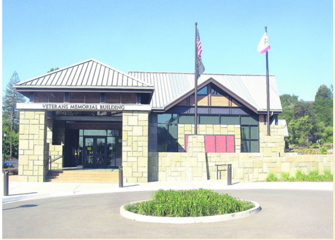
Veteran's Memorial Building on Mt. Diablo Boulevard Photo provided

In a coordinated effort, the powers that be traded two crumbling Veterans Memorial Buildings for one state of the art facility. Three years on, users can see that it was a good deal for all involved.