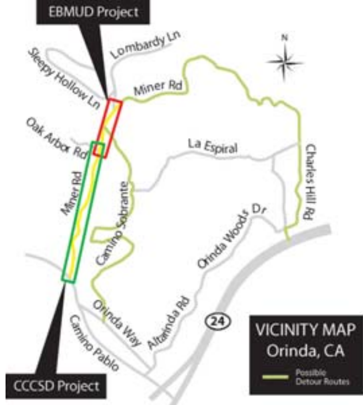
Miner Road Pipeline Project Phase 1 Maps provided by EBMUD