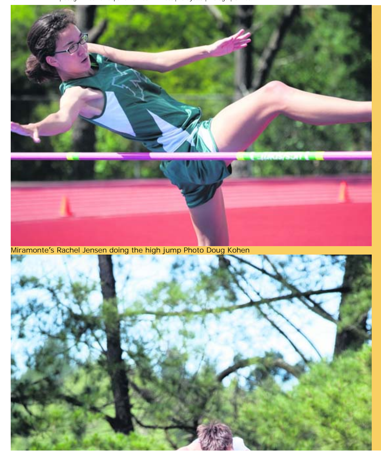
file:///C|/Documents%20and%20Settings/Andy/My%20Documents/WEB%20D...archive/issue0305/pdf/Cougar-Track-Sweeps-Lamorinda-Tri-meet.html (5 of 8) [5/12/2009 5:52:23 PM]